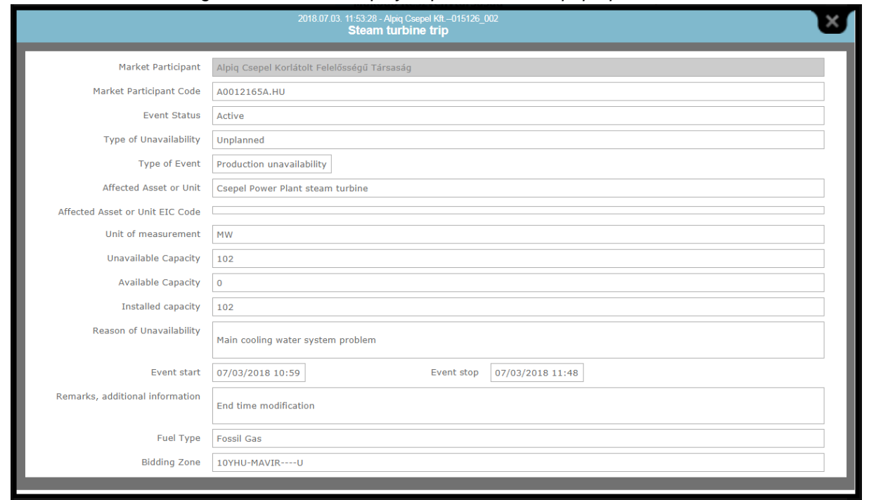
Figure No. 3 – The display of publication in a pop-up window